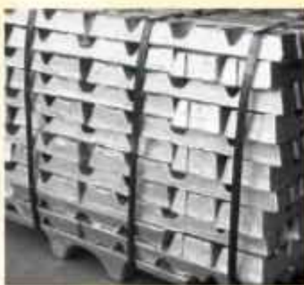
Aluminium alloy ingots